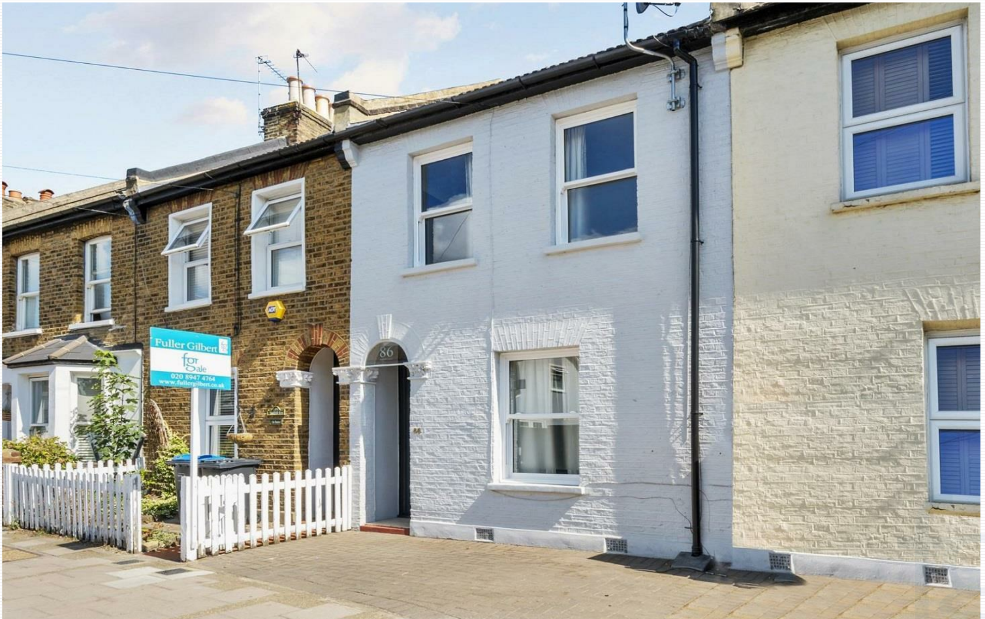
Hartfield Crescent, Wimbledon, SW19 3SA